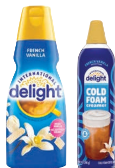
International Delight Coffee Creamer or Cold Foam 32 oz Creamer or 14 oz Cold Foam

Digital USE 5X Coupon -50¢ Digital Coupon 99¢ Final Cost