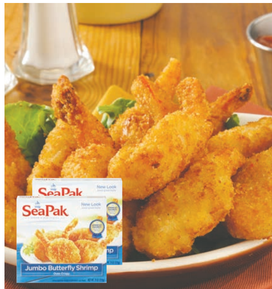
SeaPak Breaded Shrimp 8.2-18 oz Package