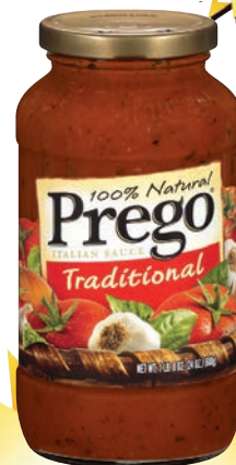
Prego Pasta Sauce 24 oz Jar Selected Varieties Traditional, Meat or Mushroom