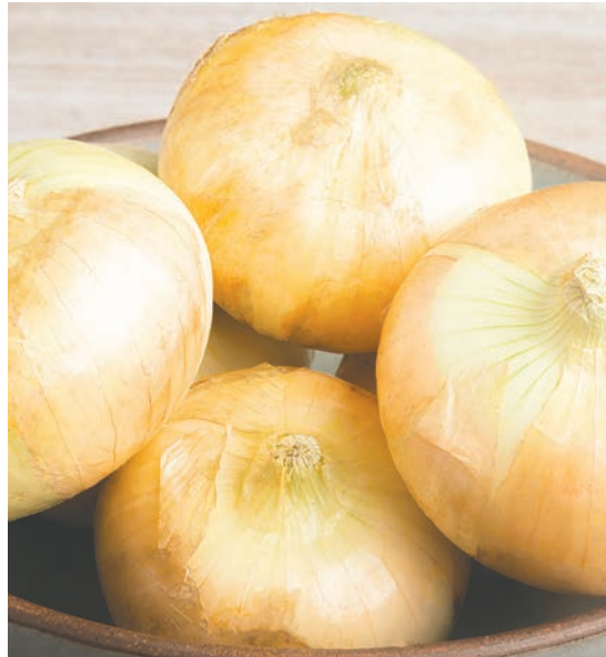
Sweet Heavenly Onions