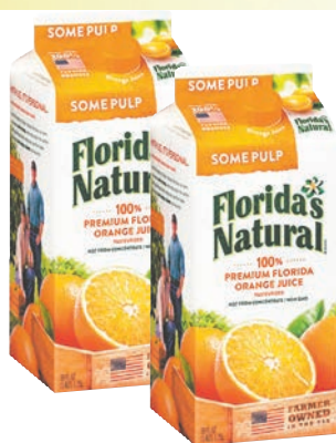
Florida's Natural Orange Juice 52 oz Carton

when you purchase 2, $2.99 when you purchase 1