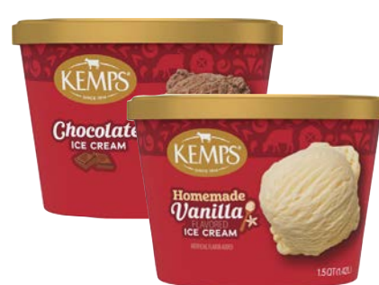
Kemps Ice Cream 48 oz Scround