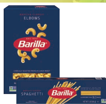
Barilla Pasta 16 oz Package