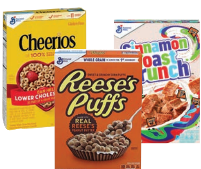
General Mills Cereals

12 oz Cinnamon Toast Crunch, 8.9 oz Cheerios, 11.5 oz Reese Puffs Cereal, 10.7 oz Trix, 11.7 oz Golden Grahams or 10.4 oz Cocoa Puffs