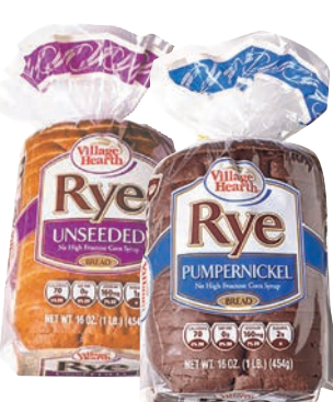
Village Hearth Rye Bread 16 oz Loaf