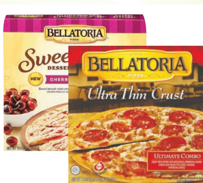
Bellatoria Ultra Thin Pizza or Sweetee Pie Dessert Pizzas 12.76-21.71 oz Ultra Thin Pizza or 14.5-15.3 oz Sweetee Pie Dessert Pizzas