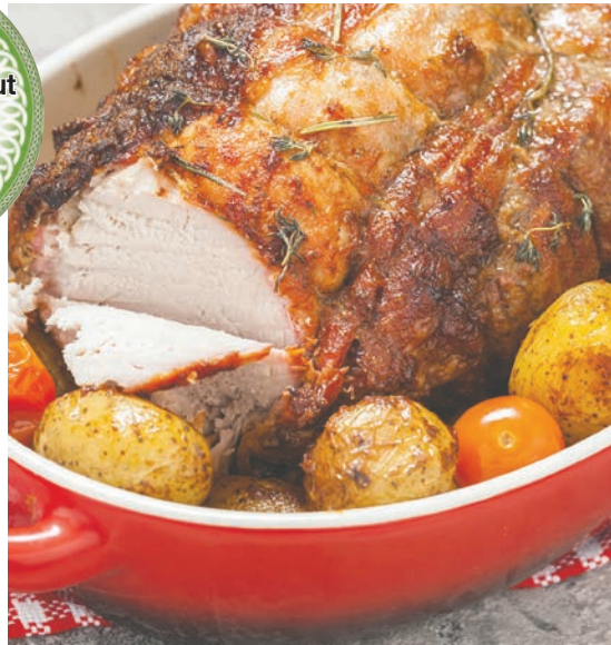
Whole in Bag Boneless Pork Loins