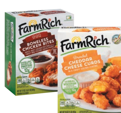
Farm Rich Appetizers 13-22 oz Package