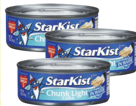
Starkist Chunk Light Tuna 5 oz Can