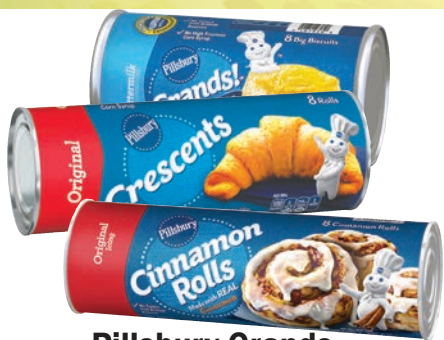
Pillsbury Grands, Crescents or Cinnamon Rolls 8-16.3 oz Package